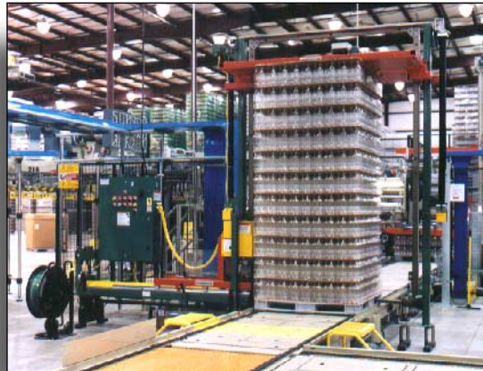
BCU-3 with optional wide platen