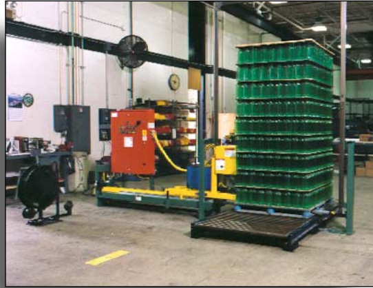
Standard BCU-3 without compression

Mounted on an indexing carriage, the MCD 510 strapping head facilitates quick retraction to the service position for maintenance. The protective covers are hinged for easy access to the service area of the head.